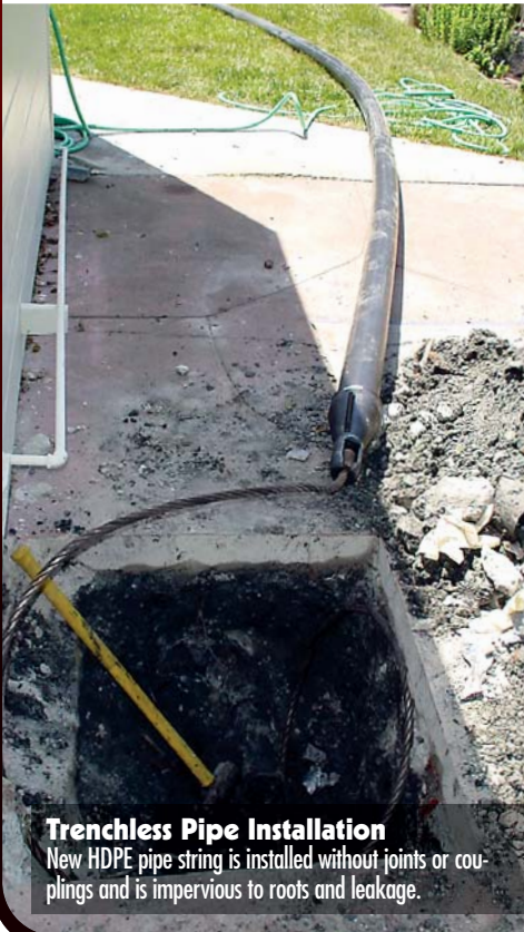
Trenchless Pipe Installation New HDPE pipe string is installed without joints or couplings and is impervious to roots and leakage.

In the field, on the phone or in your office — you can count on Hammerhead to be your trusted partner.