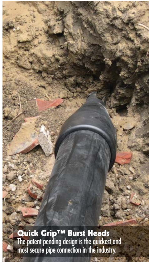
Quick Grip™ Burst Heads The patent pending design is the quickest and most secure pipe connection in the industry.